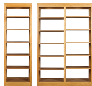
72" Open Bookcases 24" Open (left) - 24w x 17d x 72h - L200 48" Wide Open (right) - 48w x 17d x 72h - L201 All adjustable shelves