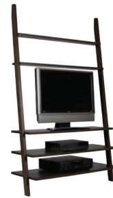
Leaning TV Stand 46w x 17d x 76h - IL102 All fixed shelves