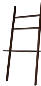
Leaning Desk 32w x 24d x 76h IL101 All fixed shelves